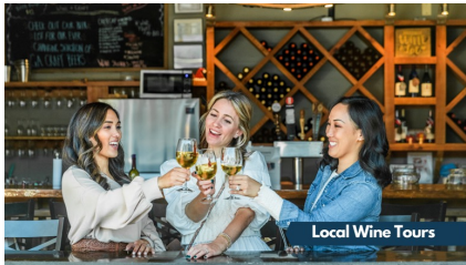
Local Wine Tours

ASSOCIATION OF CONVENTION & VISITORS BUREAUS